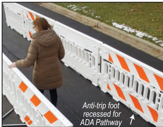
Create ADA Compliant Pedestrian Pathway