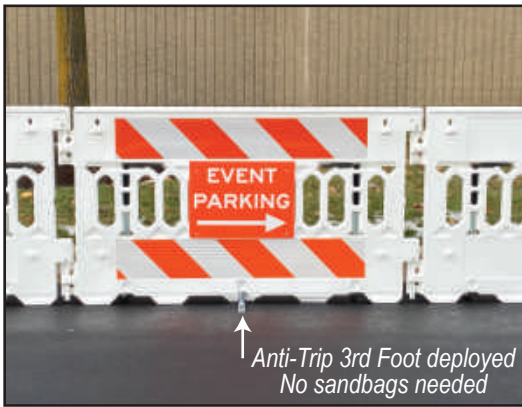
Add Signs for Crowd Control