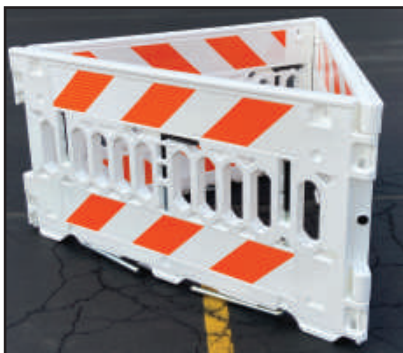
Use Three Units To Create Manhole Guard

Sign Area: Holds 20"W x 14"H Sign on each side (screw on)