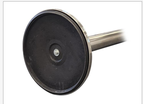
Full Circumference Floor Protector